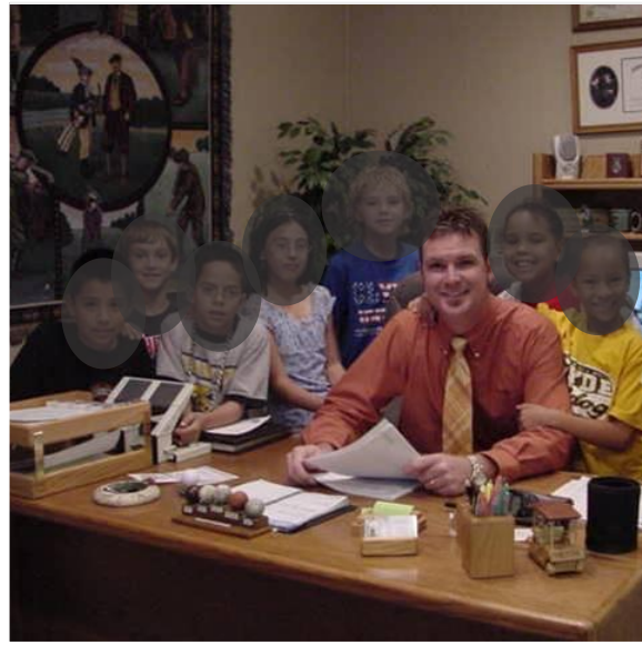
8 years as an elementary principal