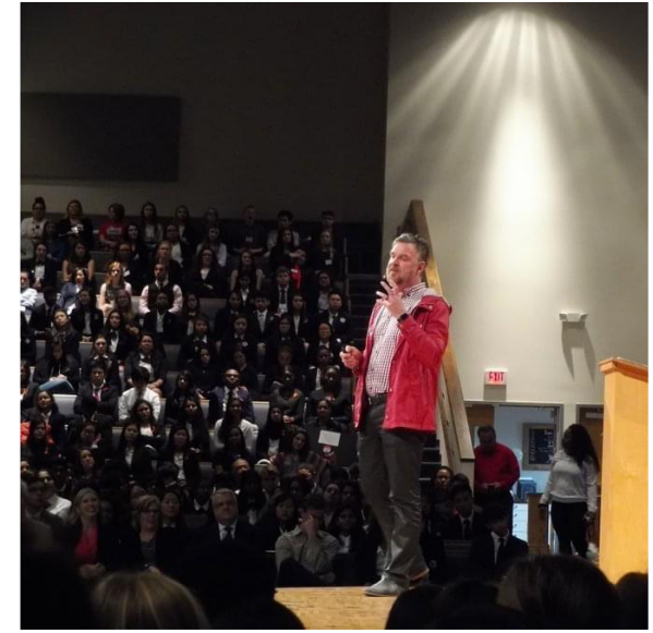
20 years as a consultant & keynote speaker