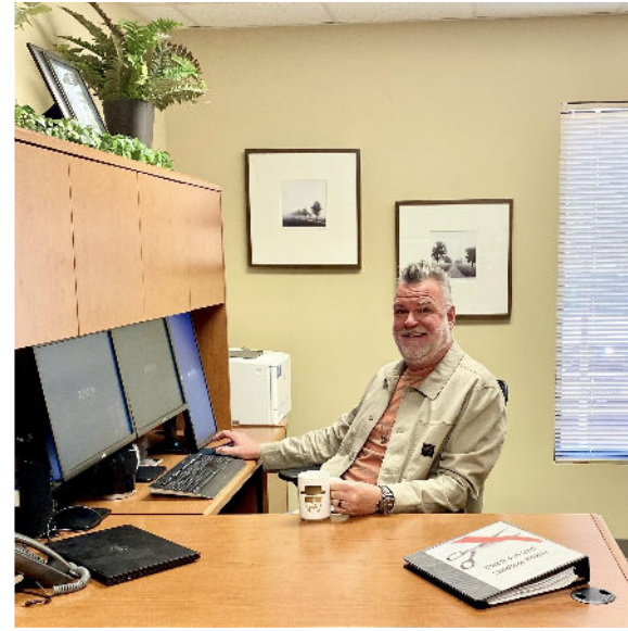
14 years as a central office administrator