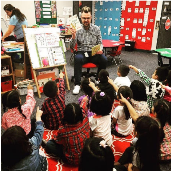
4 years as an elementary teacher